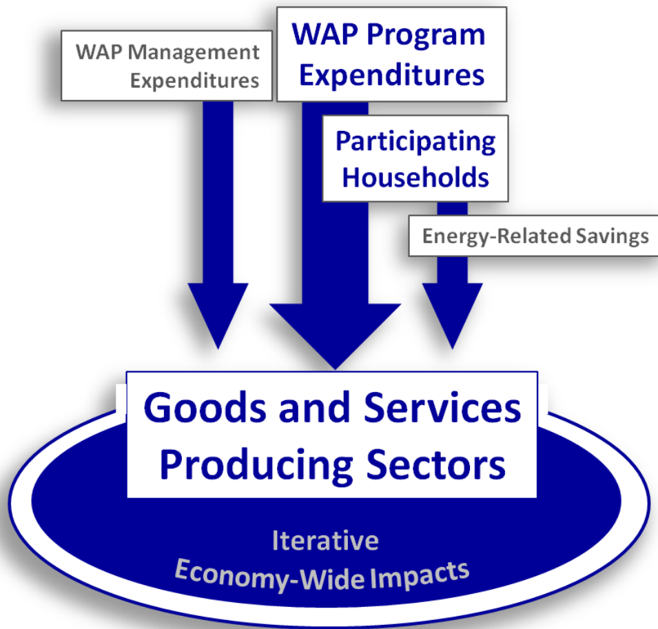
Figure 1.1 Program Impacts